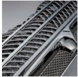
Figure 1-2: Sanitary and automotive parts with TriChrome® finishes