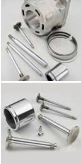
Figure 1-2: Automotive parts plated in a hard chrome bath with Fumetrol® 21 LF 2