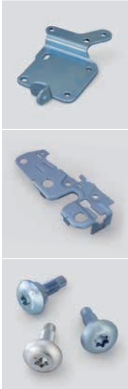
Figure 1-3: Parts plated with Tridur® DB