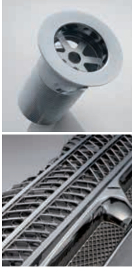
Figure 1-2: Sanitary and automotive parts with TriChrome® finishes