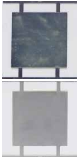
2% K2S immersion test / 5 mins (0.2 µm Ag) with pre-baking @ 200 °C, 1 hour