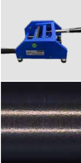
Bend Test for ductility as per ASTM B 489-85