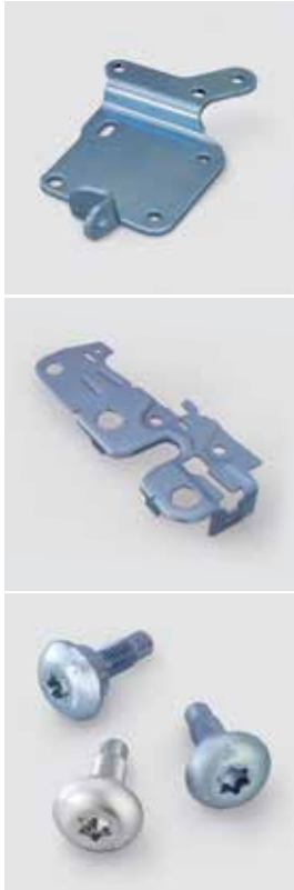
Figure 1-3: Parts plated with Tridur® DB