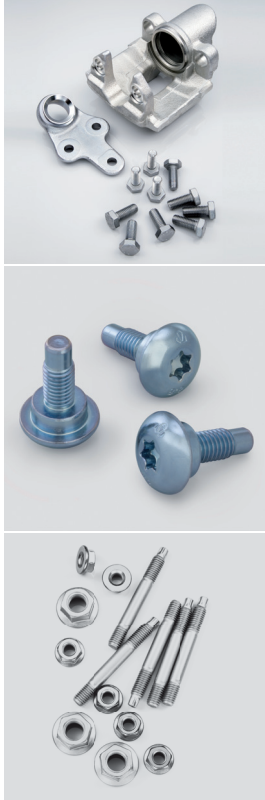
Figure 1-3: Zinni® 220 is particularly suitable for the brake caliper industry due to higher thickness in low current density areas – but also the right choice for many other parts.