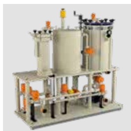
Figure 1: Satilume® Plus plated automotive parts