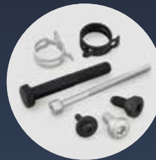
Fasteners and fixings