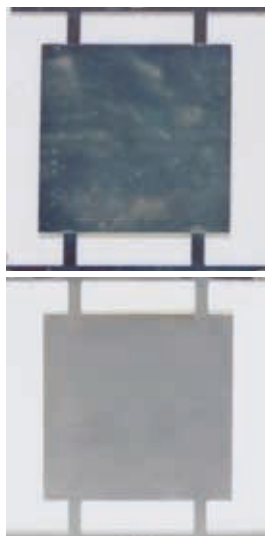
2% K2S immersion test / 5 mins (0.2 \mu\text{m} Ag) with pre-baking @ 200 °C, 1 hour