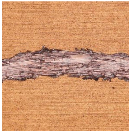
Figure 3: 1.5 \mu\text{m} Ni, 0.3 \mu\text{m} Au plated on Copper base

The following figures show wear-off tests with different plated Nickel-Gold surfaces. Gold was plated onto pure Nickel (Fig. 3) and Nickel-Tungsten alloy (Fig. 4) with a Copper base.