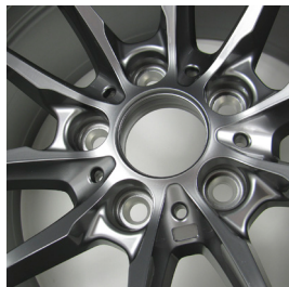
Figure 1: Achieving a superior finish is easier than ever with Atotech aluminum wheel paint pretreatment process